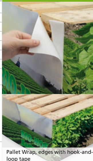
Pallet Wrap, edges with hook-and-loop tape

All sizes are approximate. As we are constantly developing our products we reserve the right of changing technical issues and dimensional deviations.