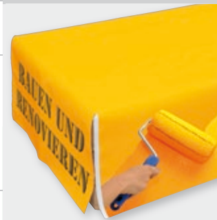
Pallet Cover made of PVC, edges with hook-and-loop tape