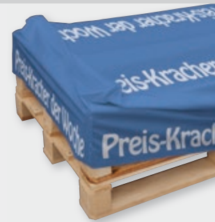
Pallet Cover made of fabric, hemmed edges