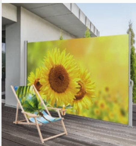
motif on the front, back: white