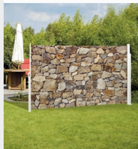
motif on the back, front: white