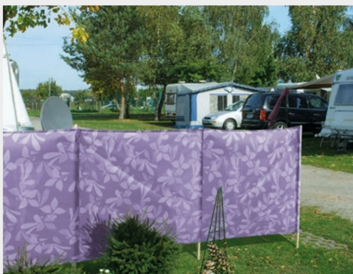
mobile windbreaks in a line

Especially for hotels near or with access to the beach the portable windbreaks provide an exceptional advertising space for your logo or company name—by the way your guests will be happy to have a calm, protected oasis by the sea.