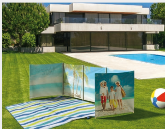
mobile windbreaks in the U-shape