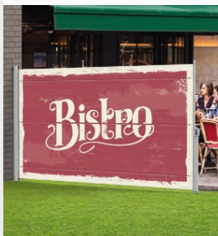
motif on the back, front: white