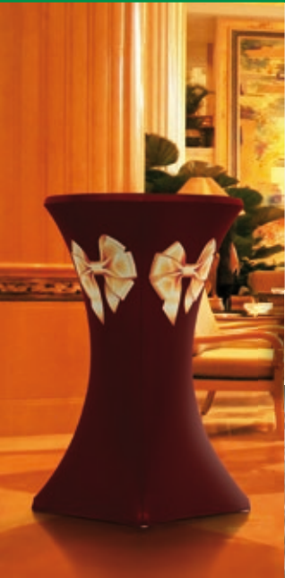
Table Cloths, Table Runners and Table Covers