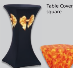
Table Cover square

Appropriate folding tables and folding benches for table cloths are also available at your disposal. Complete your sets of folding tables with padded bench cushions of the same design.